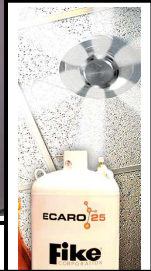
Fike ECARO-25 Fire Extinguishing Agent Puts Out Fire

Fike Fire Suppression Systems are distributed in your area by: