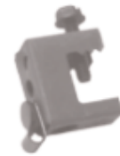
Beam Clamp, Spring Steel